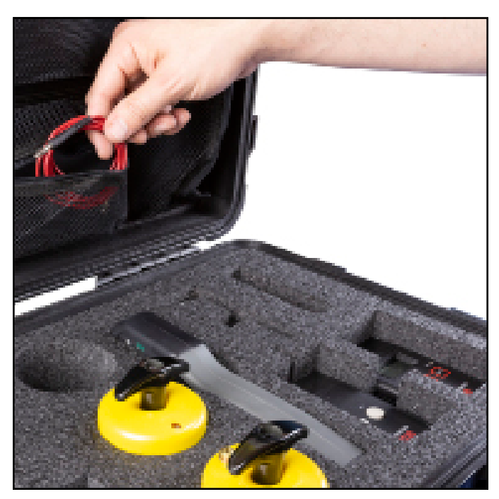
Figure 2. Using the EOS/ESD Assessment Kit's lid organizer

https://www.esda.org/standards/esda-documents/