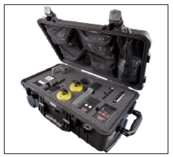
Figure 1. SCS 770045 EOS/ESD Assessment Kit